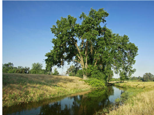
Kaweah Oaks Preserve

Our process is aligned to the LCFF Priority 6 Model Practices and grounded in school climate requirements ( E.C. 52052 )